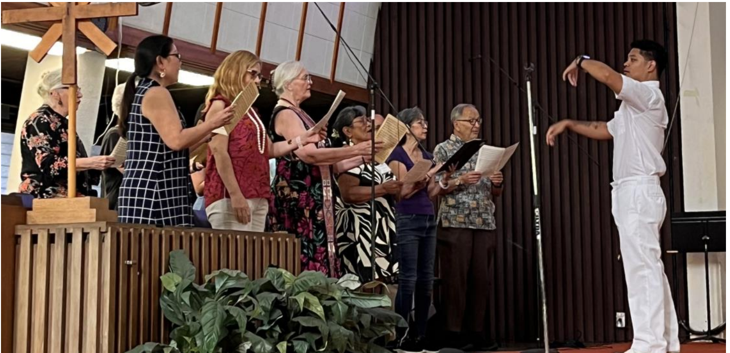
The Harris UMC Fellowship Choir performs the Gift of Music on Sunday, March 30th.