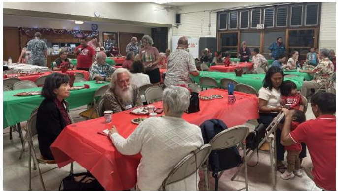
Christmas Caroling-Dec. 18th