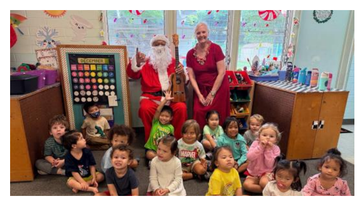
Students enjoy a special visit from Santa on Dec. 18th.