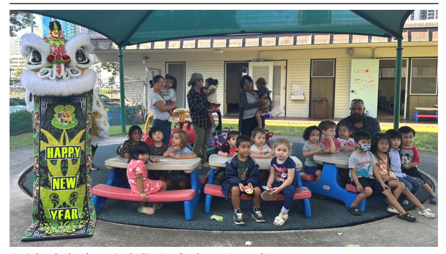
Harris Preschool students enjoy the Sing Yung lion dance on January 21st.