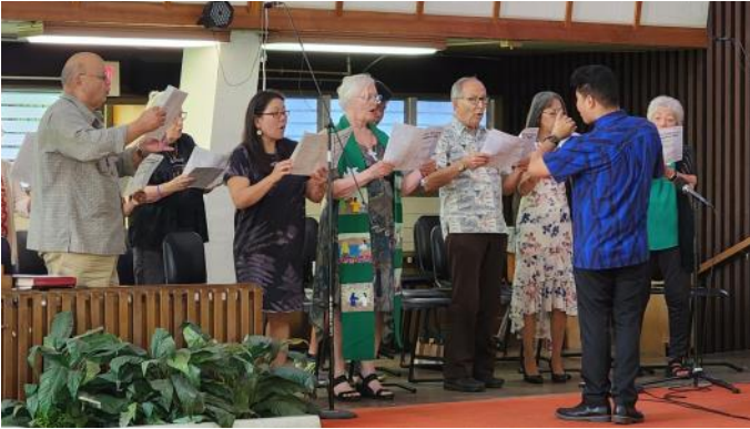
The Harris Fellowship Choir performs The Gift of Music: "O For a Thousand Tongues to Sing"