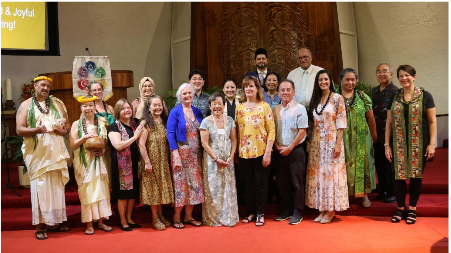
63rd Annual Nuuanu Valley Interfaith Service on Nov. 26th. Continued on Page 5.