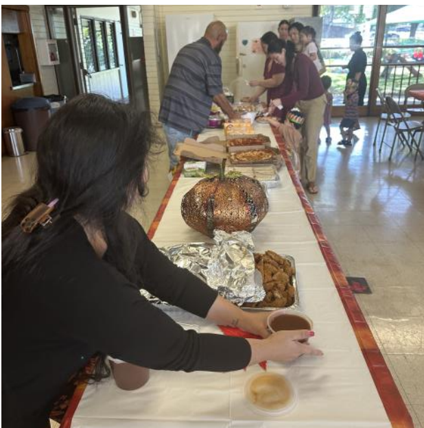
The preschool families gathered for an annual Thanksgiving Luncheon in Miyama Hall on Nov. 27th.