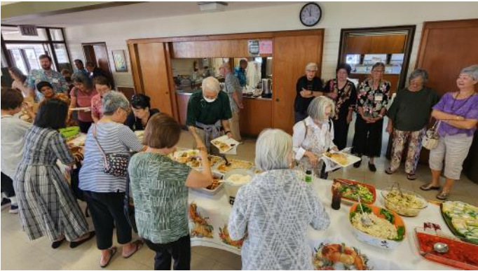
Thanksgiving Potluck in Miyama Hall on Nov. 24th.