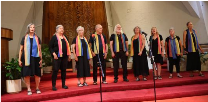
Nuuanu Valley Interfaith Service at the Community Church of Honolulu on Nov. 26th.