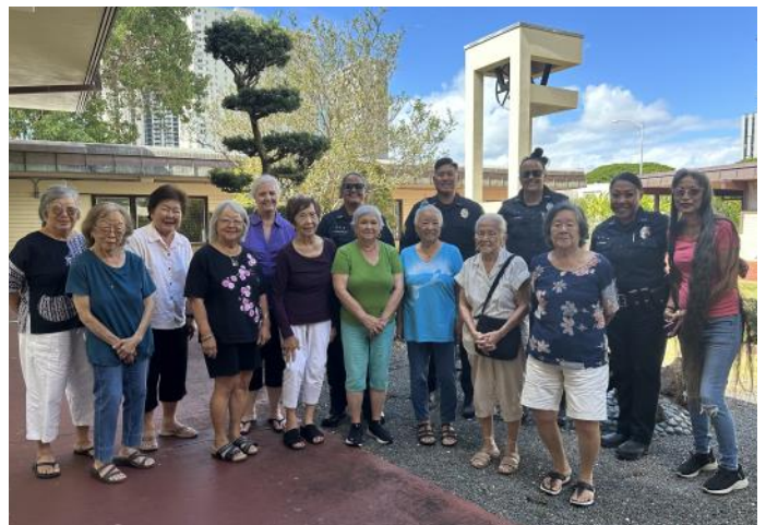
HPD Scam Awareness Presentation on October 17th.