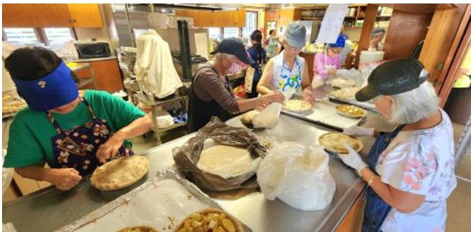
The Harris UMC kitchen on October 13th for Pie Presale Day #2.