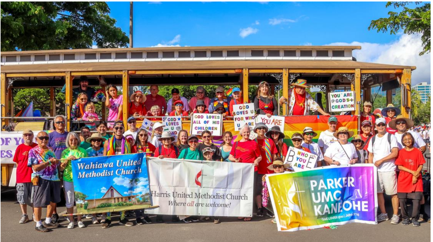
Honolulu Pride Parade on October 19th.