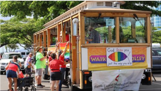
UMC Pride Parade trolley on October 19th.