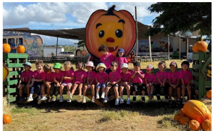
Field Trip to Aloun Farms on October 25th.