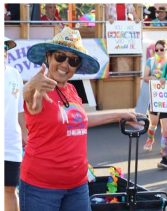
October 19th: Honolulu Pride Parade. Continued on Page 4.

Thank you for attending October worship services and events. You are invited to the Harris UMC Mission Bazaar on Nov. 2nd, All Saints Day Service on Nov. 10th, and Thanksgiving Sunday on Nov. 24th!