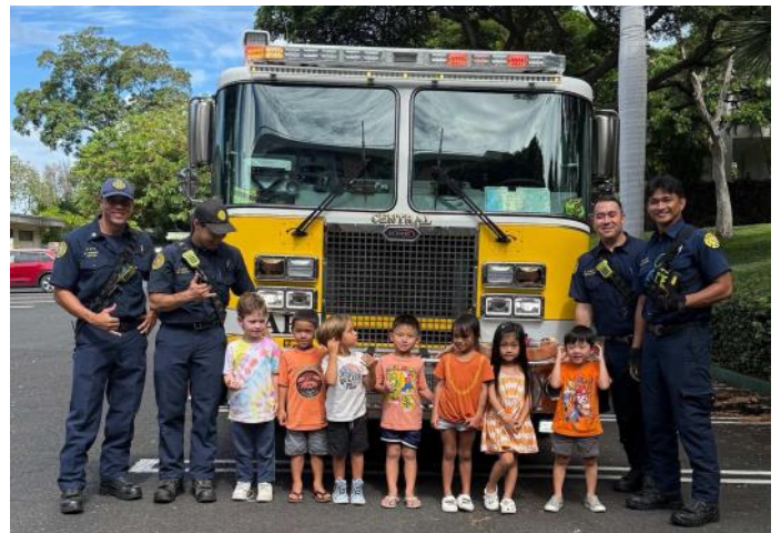
Honolulu Fire Department visit to Harris Preschool on Oct. 4th. Students toured the truck and shot water out the fire hose.