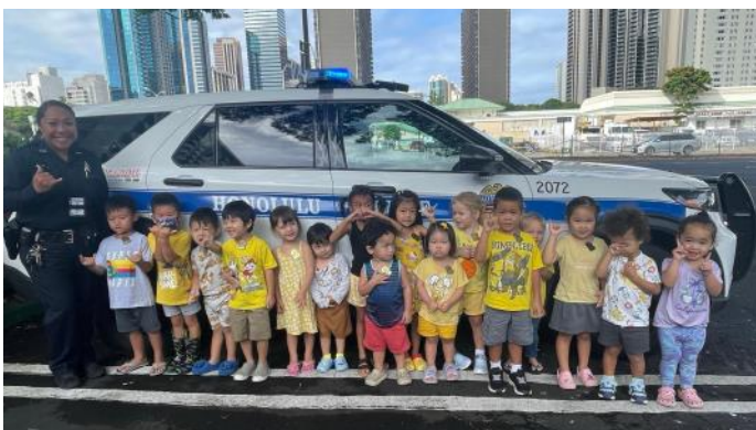
The preschool students get a visit from The Honolulu Police Department on September 20th.