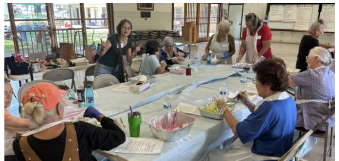
Silk scarf dyeing in Miyama Hall on Sept. 19th with lunch in Komuro Lounge.