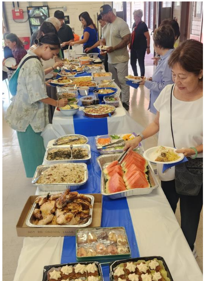
Stewardship Celebration Potluck after worship service in Miyama Hall on Sept. 29th.