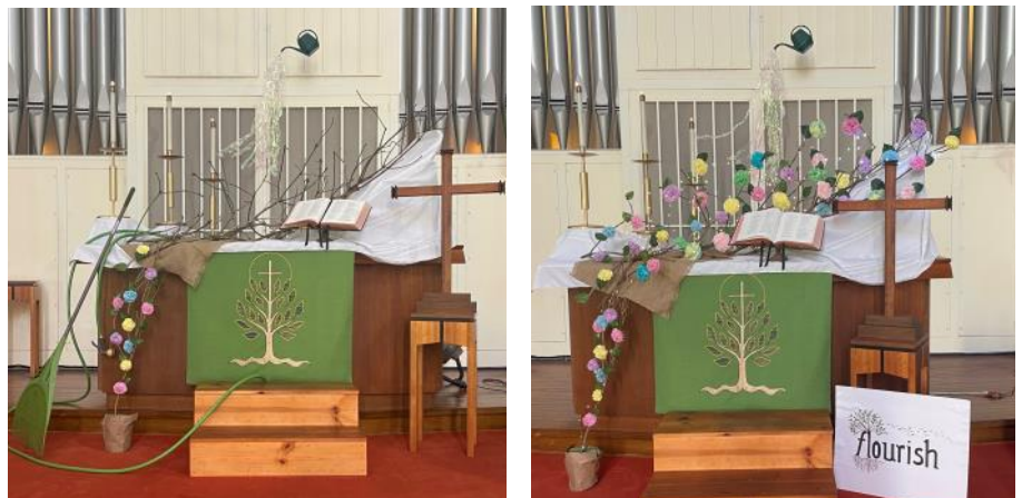
The altar in the Sanctuary during the Stewardship Campaign FLOURISH: The Grace of Giving. Week 1 vs. Week 4.

Thank you for joining us for our September Stewardship Campaign. Please join us in October for World Communion Sunday on Oct. 6, Laity Sunday on Oct. 29, and the Harris UMC Mission Bazaar on Nov. 2!