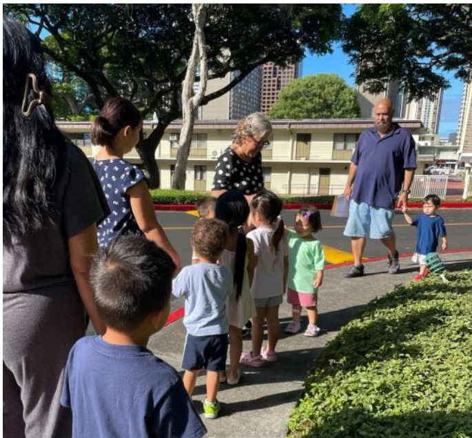
Harris Preschool fire drill on Sept. 9th.