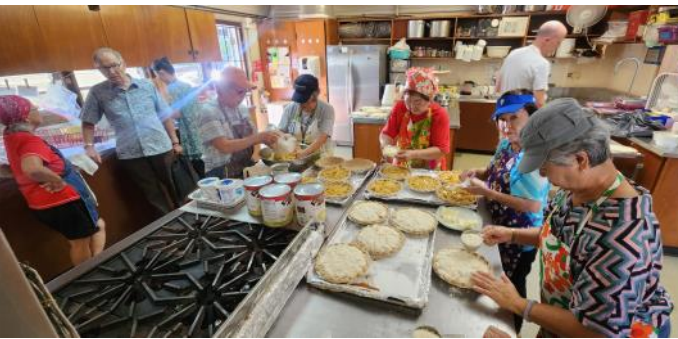
The Harris UMC kitchen on Sept. 19th for Pie Presale Day.