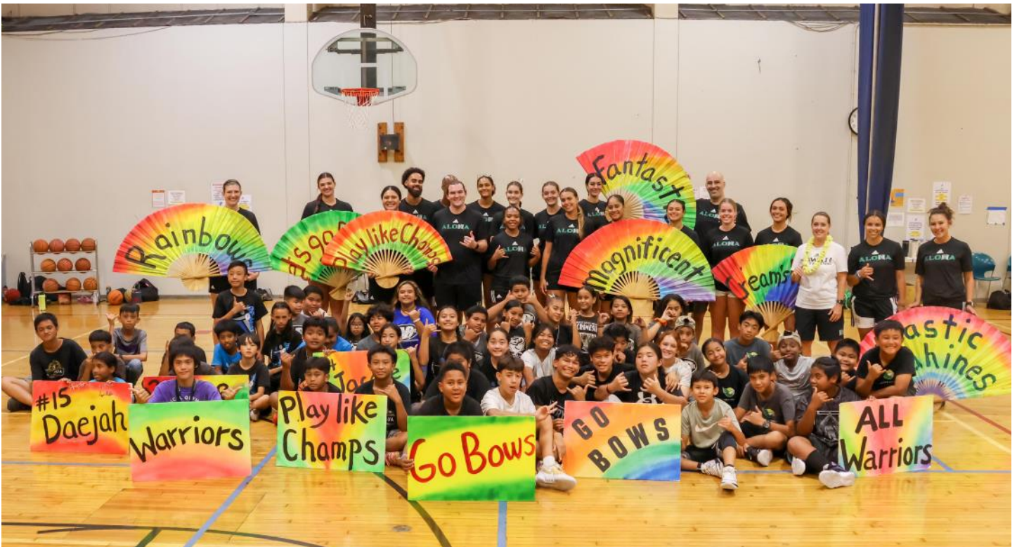
Uh Wahine Basketball Clinic at Nuuanu YMCA on Sept. 20th. Continued on Page 4.