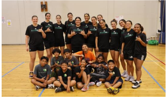
The Y gym was alive with the sound of bouncing balls and cheers from middle schoolers from the After School All Stars programs at Ke'elikolani, Washington, Kalakaua, Jarret, the Y youth program and youth from KKV. With the Wahine players and coaches there were at least 100 participants! Mahalo for your support!