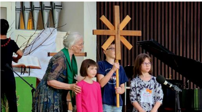
Stewardship worship service on Sept. 22nd.