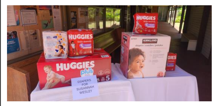
Diaper donations for the Susannah Wesley Community Center.