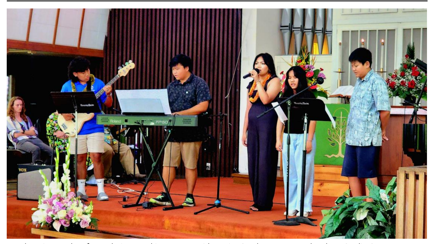
Youth Praise Band performs during worship on Peace with Justice Sunday, August 11th.