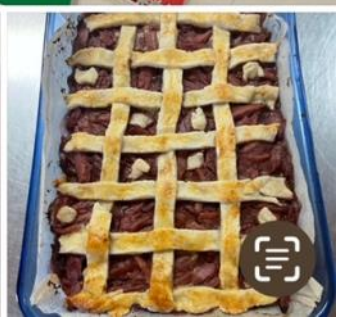
Crafts and lunch on July 18th.