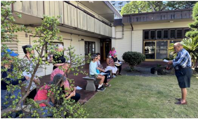
The peace bell was rung in the courtyard on August 6th to commemorate the nuclear bombing of Hiroshima.