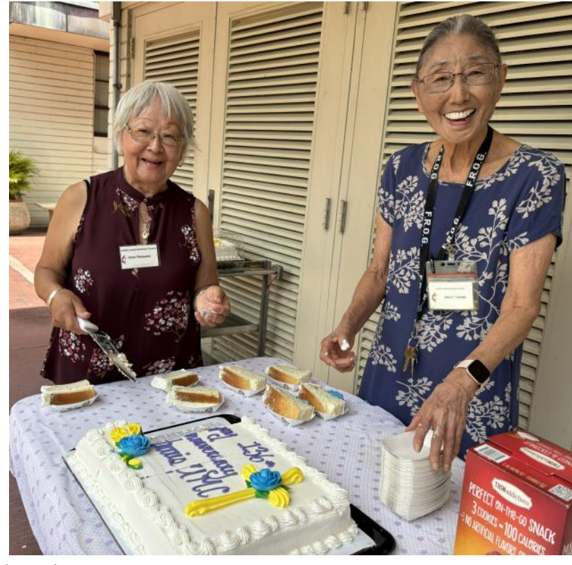
Harris UMC celebrated its 136th Anniversary on July 14th.