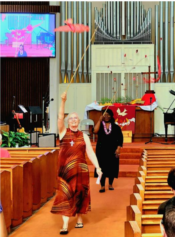
Pentecost Sunday, May 19th.