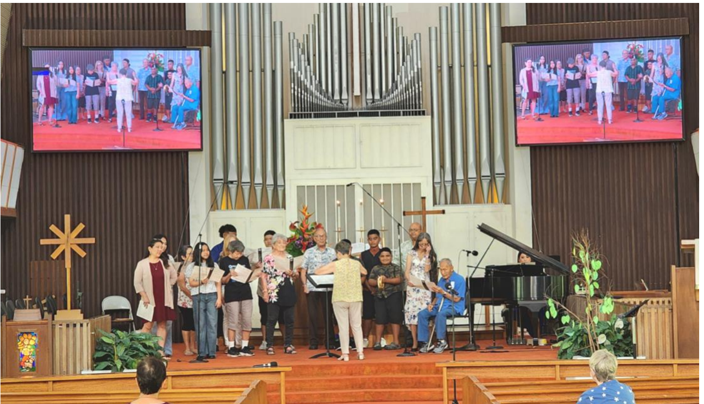
Harris UMC choir during worship service on Trinity Sunday, May 26th.