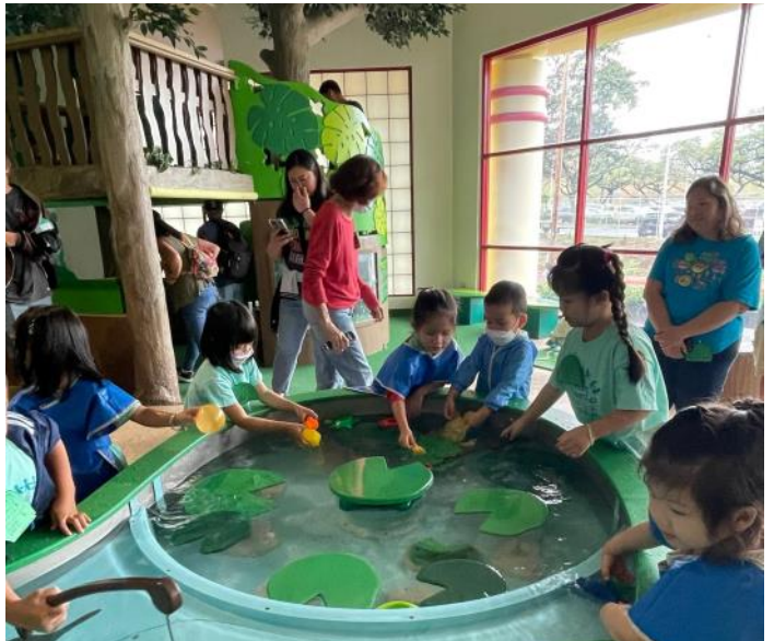
Field trip to the Children's Discovery Center on April 12th.