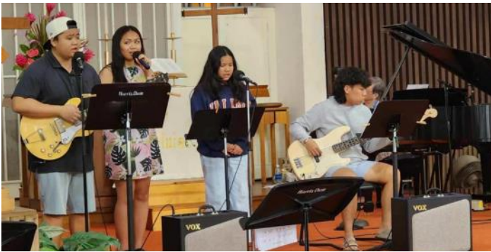
The Ukulele Fellowship and Youth Praise Band during worship service on April 14th.