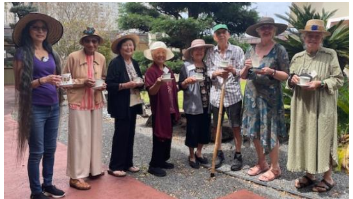
The Royukai March outing to Tea At 1024. The Royukai Senior Fellowship meets on the 3rd Thursday of every month from 9:30am to 12:00 pm.