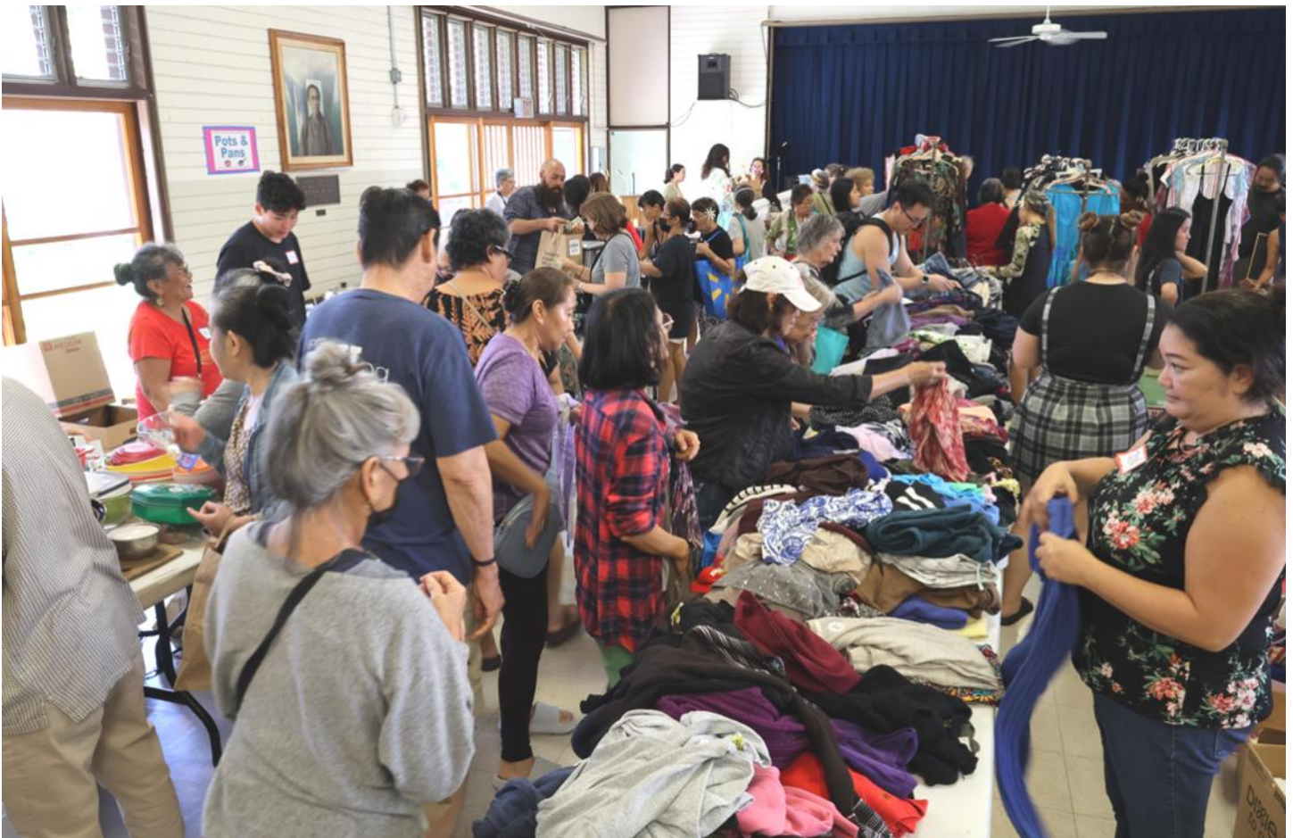
Miyama Hall during the 2024 Rummage Sale on Saturday, April 20th.