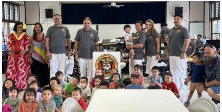
The Royal Hawaiian Band visits Harris Preschool students on April 11th.