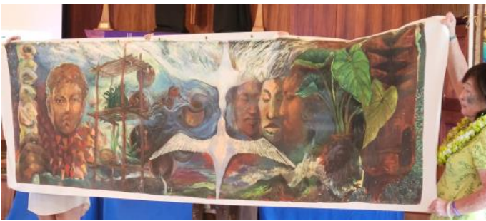
Frontside of the mural showing hope for the 'aina.