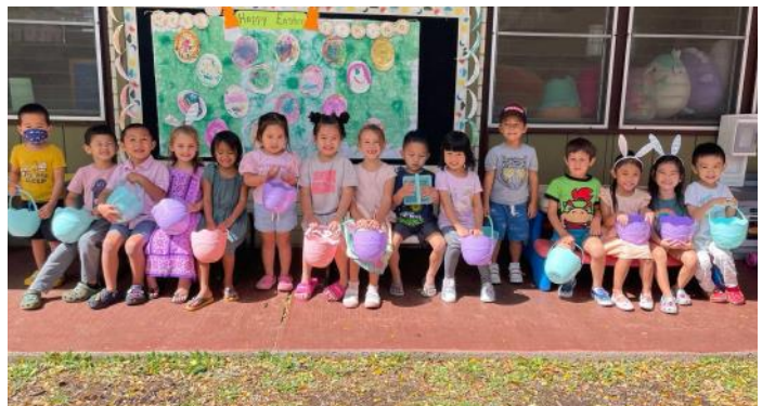
The preschool students prepare for an egg hunt on March 28th.