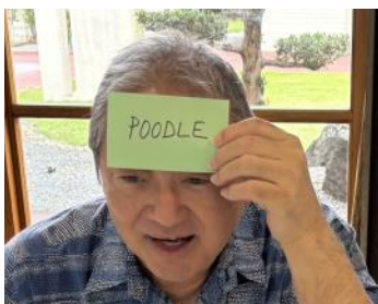
Fun games at Harris Ohana Fun Day on March 10th.