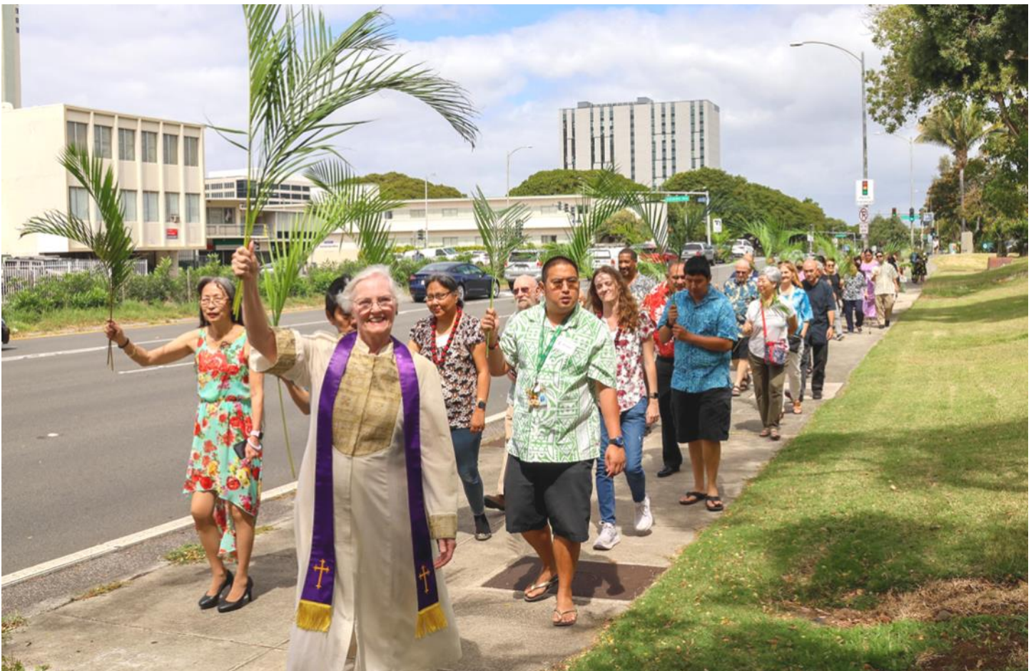
Palm Procession on Nuuanu Avenue. Palm Sunday, March 24th. Continued on Page 4.