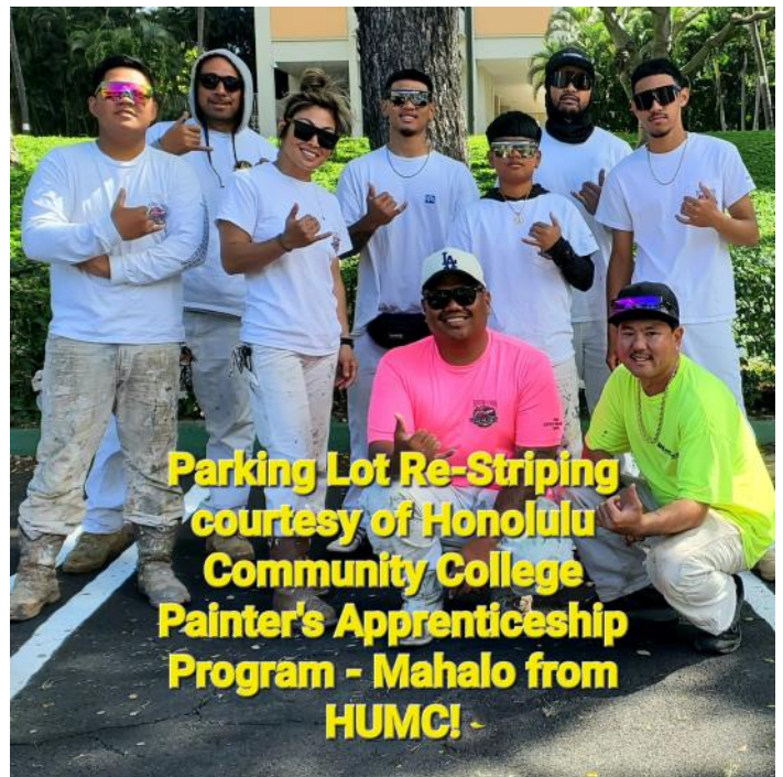
Big mahalo to the Trustees and the Honolulu Community College for organizing and re-striping the Harris parking lot on March 16th.