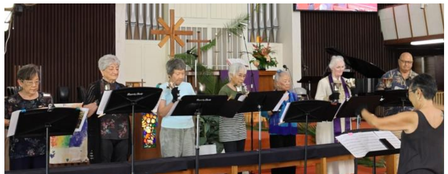
The Handbell Ensemble performing during Palm Sunday worship service.

Thank you for joining us for Holy Week worship services in March. Please join us in April for Sunday worship and preparations for the 2024 Rummage Sale!