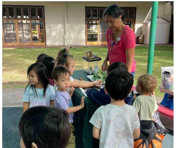
Harris students learn about the life cycle of monarch butterflies.