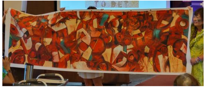
Backside of the mural depicting pain.