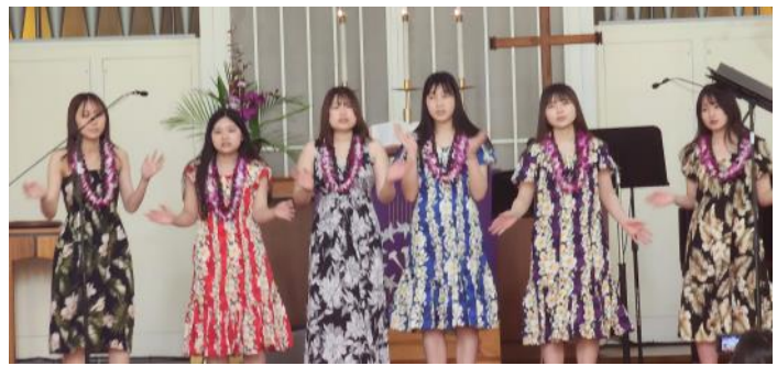
Jogakuin University Choir performing "Oh Happy Day".