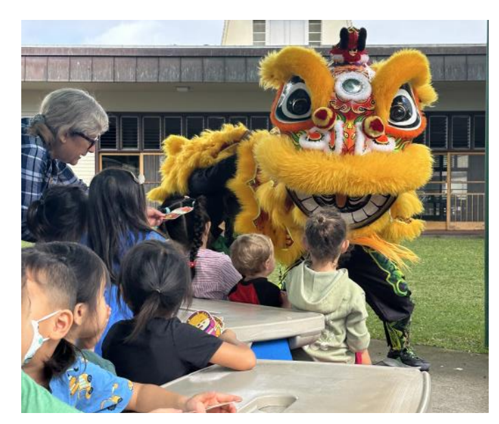
Lion Dance on February 9th.