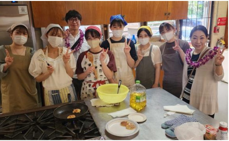
Hiroshima Jyogakuin University students prepare lunch for the Royukai Reunion on February 22nd.