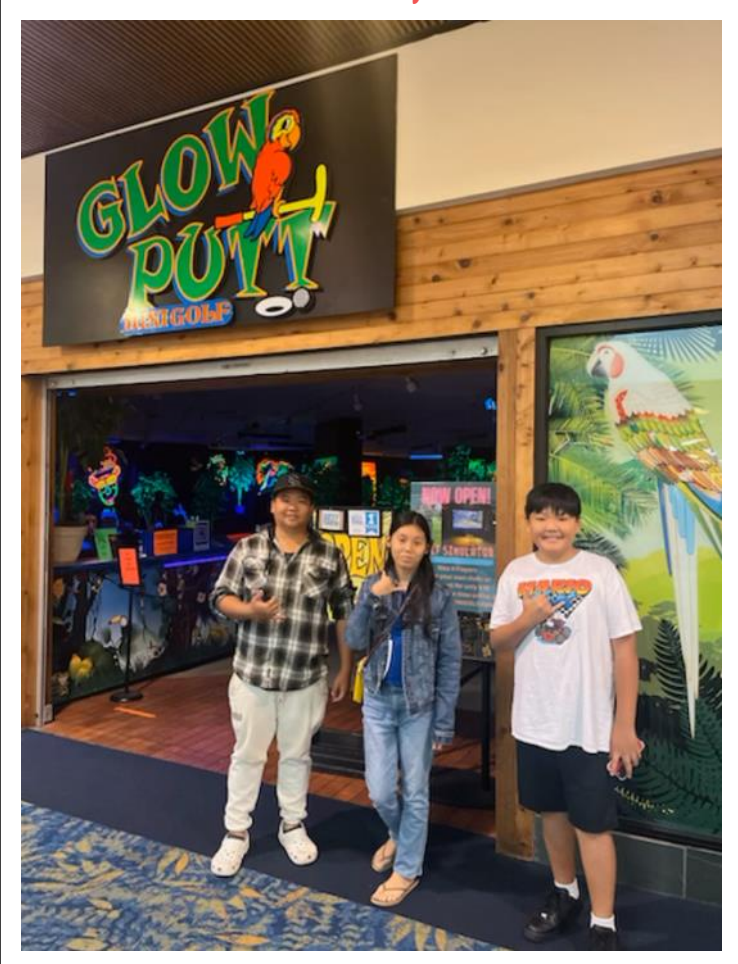
Harris Youth enjoy Glow Putt on February 28.