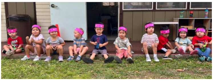
February 14th-Preschool students on Valentine's Day.