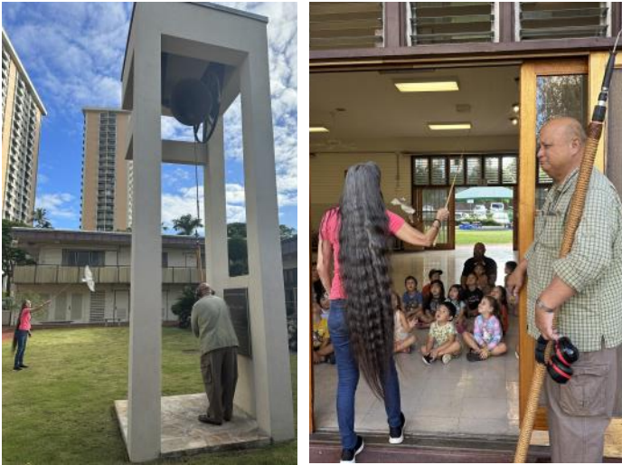
The students watched the ringing of the Harris UMC Peace Bell for Pearl Harbor Day on December 7th.