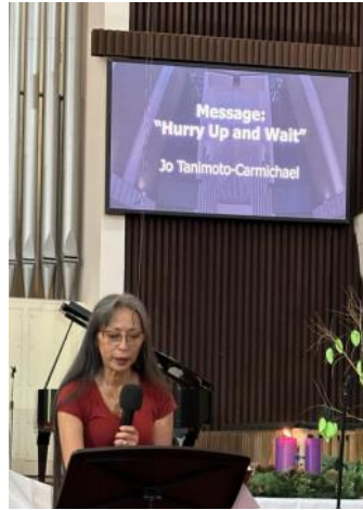
Contemporary Service on December 3rd.