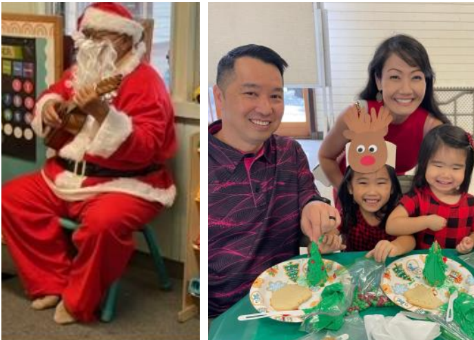
A visit from Santa on December 19th and cookie Decorating in Miyama Hall on Dec. 22nd.