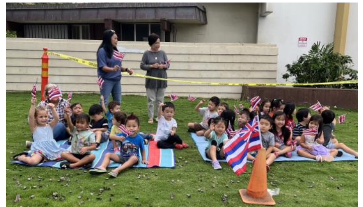
Students wave the Hawaiian flag as they watch the Queen Liliuokalani parade on January 17th.