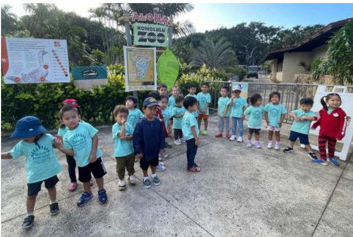
Honolulu Zoo field trip on January 12th.