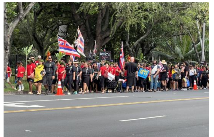
For more information on Harris Preschool, visit https://harrisumc.org/preschool/