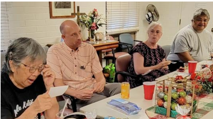
The Staff Parish Relations Committee (SPRC) hosted a Christmas luncheon for our wonderful, talented staff in Komuro Lounge on December 9th.