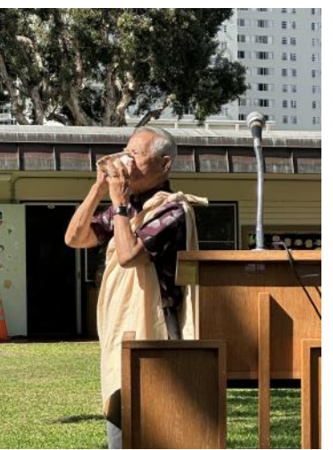
Playground celebration on October 26th.