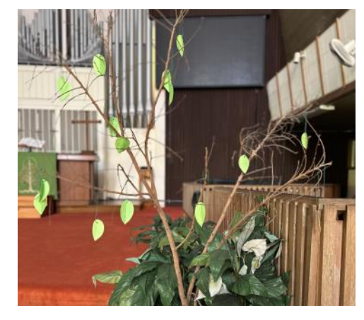
Tree of Hope for Lahaina on October 22nd.

Join us in November as we continue our Stewardship Campaign G.I.F.T., remember our loved ones who have passed on all Saints Day, and celebrate Thanksgiving!