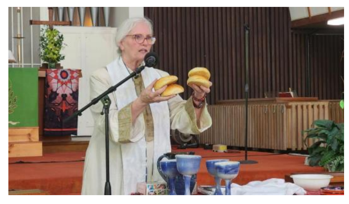
Worship Service on Oct. 1st.