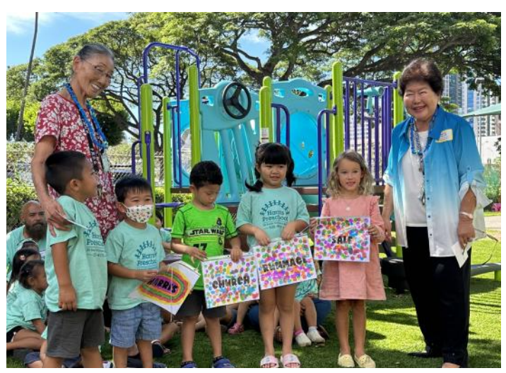
The students gave leis and presented banners to the donors.