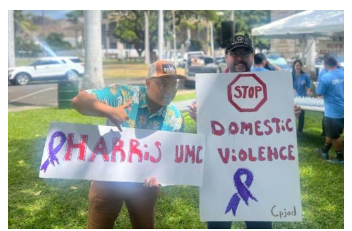
29th annual Men's March Against Violence on October 5th.