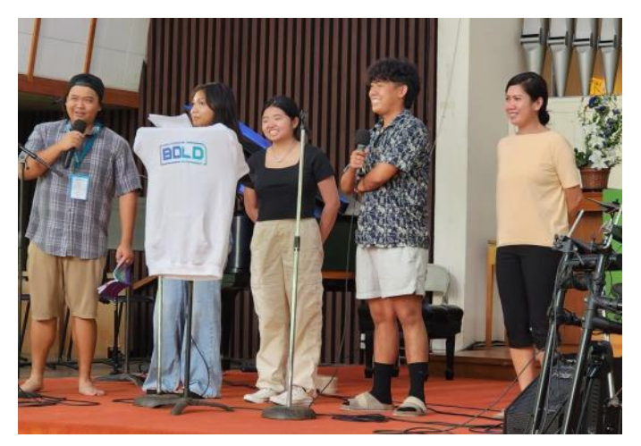
World Communion Sunday