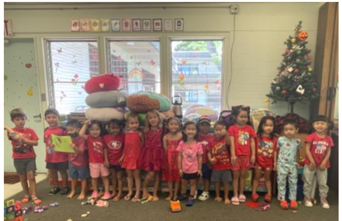
Red Day—Harris Preschool students celebrated a different color each Friday in September.