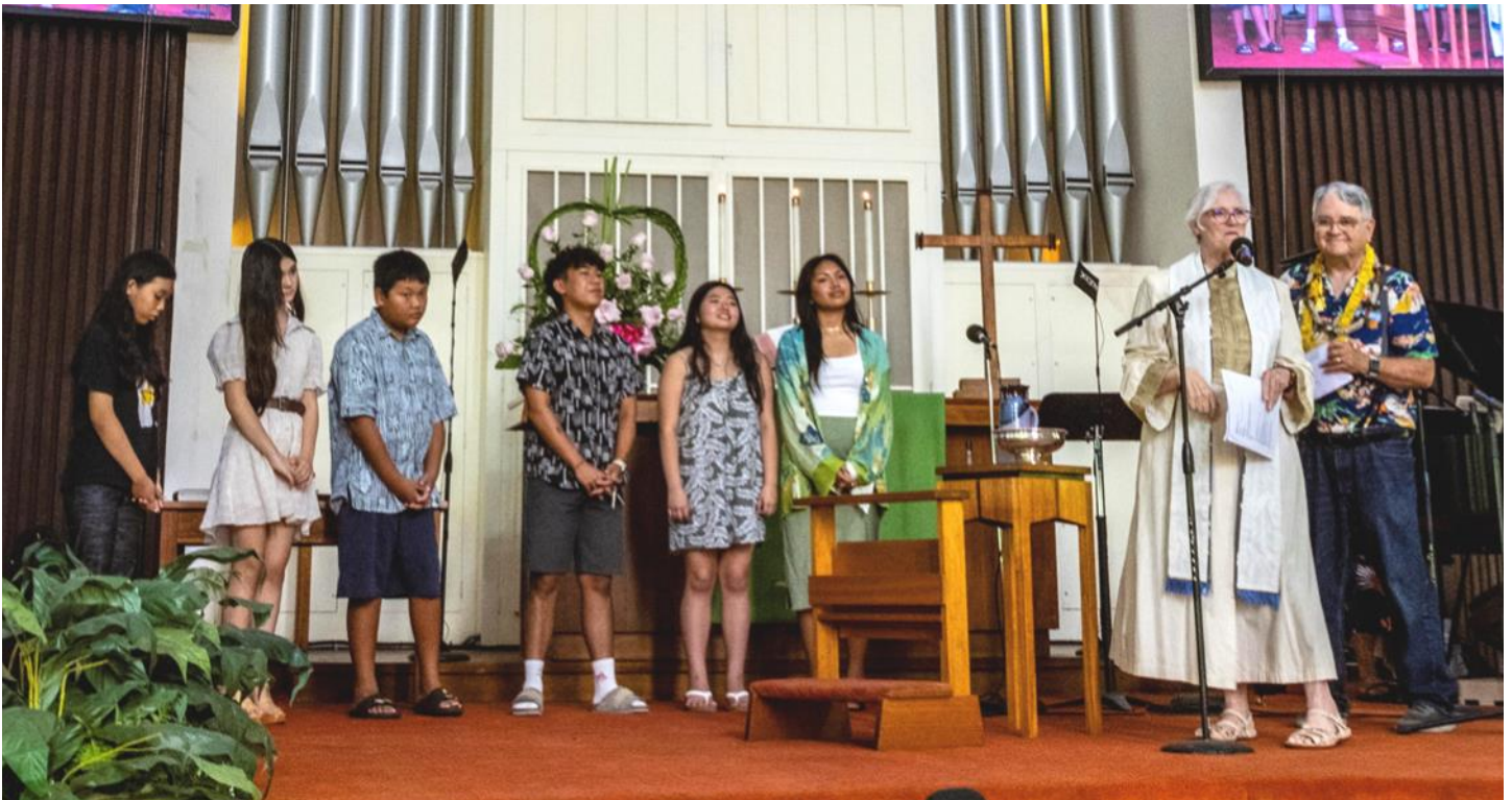
Confirmation Sunday worship service on September 24th.