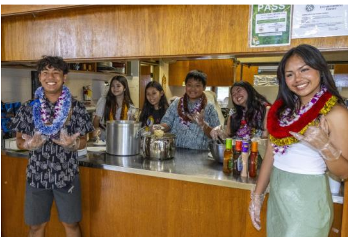
Youth confirmands at the Confirmation potluck in Miyama Hall on September 24th.