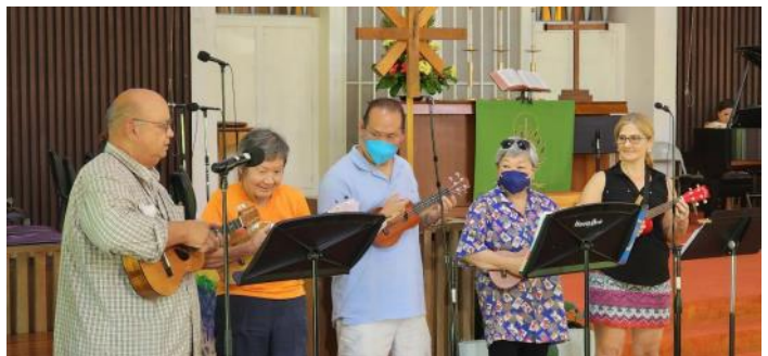
Ukulele Fellowship performs on Peace with Justice Sunday.