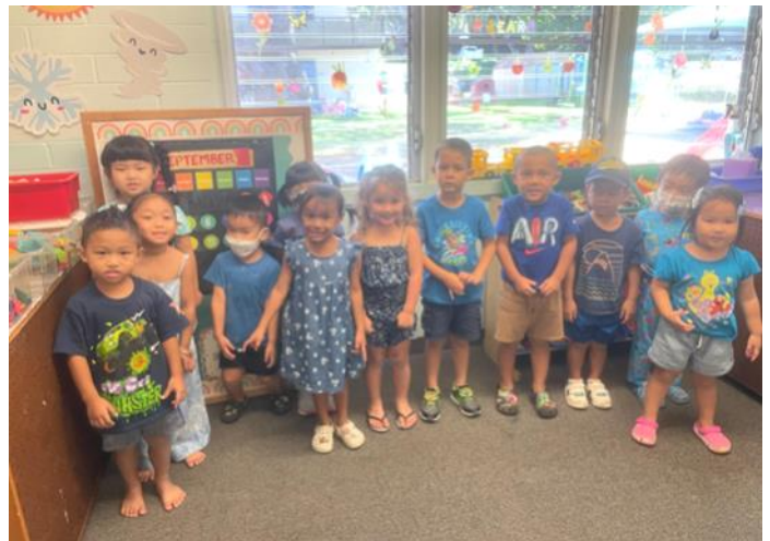
Blue Day on September 15th.